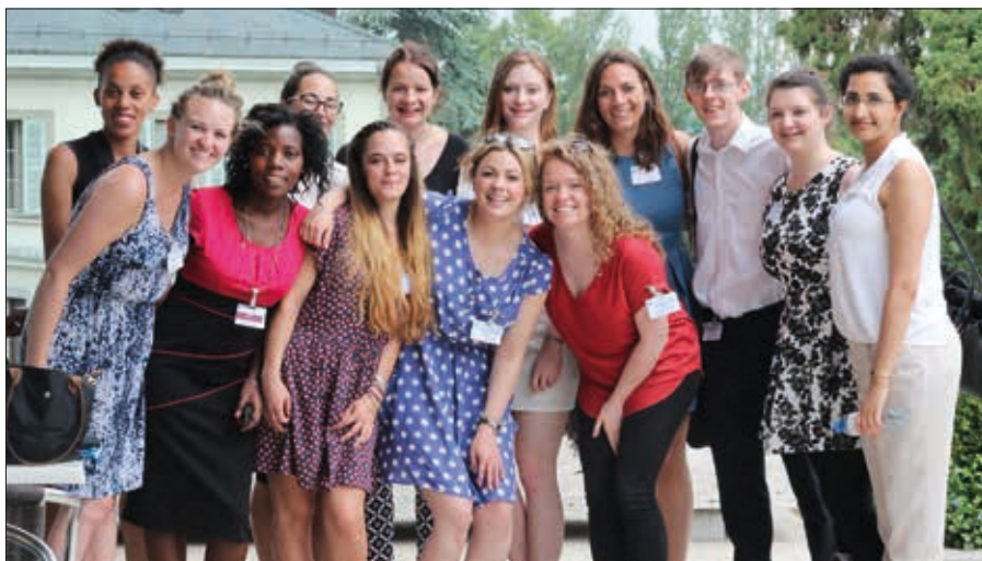
Participants at the 2015 Geneva Summer School.

The Geneva Summer School gave us the opportunity to understand how Quakers and Quaker values can play an important role in pushing international organisations to make changes for a more peaceful world.