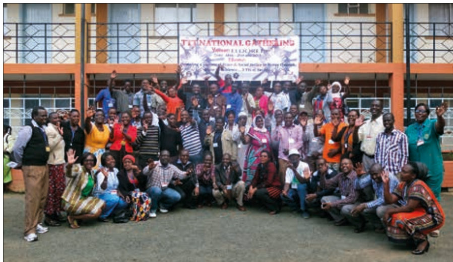
Activists from across Kenya gathered at a conference centre in Kisumu to celebrate five years of nonviolent campaigning success.

“Before I joined Turning the Tide I was just like anybody else. I just took life the way people take it. But, shortly, life changed. I joined this training... and I realised that however much life has been challenging it is now high time I should change also the way of my thinking and face life now, positively. I learned about the principle of Turning the Tide... remember also the opponent. That really touched me. However much those people neglected me, mistreated me, I have to consider them also as human beings.”