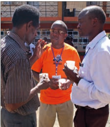
Sharing stories during a coffee break.

Many campaigns involve challenging the corruption that sabotages large investments – from road construction to agricultural loans to healthcare provision. By supporting these campaigns, QPSW’s Kenya programme can use its limited resources to help create sustainable livelihoods far more effectively than by investing directly in development initiatives.