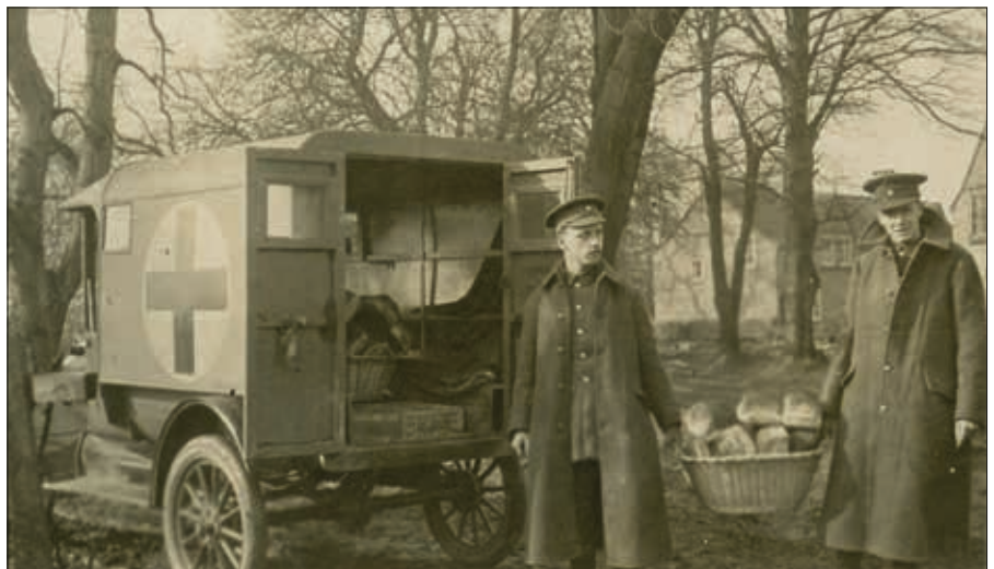
Around 1,200 conscientious objectors served with the Friends Ambulance Unit, set up by Quakers in 1914 so that pacifists could help those suffering in the war.